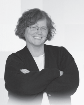
LOWER TAXES FOR SMALL BUSINESS OWNERS, FARMERS AND FISHERMEN

Contact your local financial institution to learn more about the rules of this important savings vehicle.